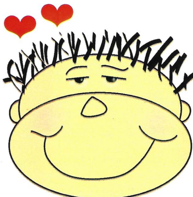
Loved Amado / querido